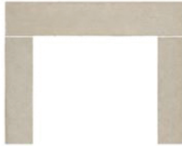
Standard Adjustable Facing