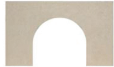
Arched Seamless Facing Request by phone or during measurement confirmation process for an additional charge