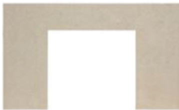
Standard Seamless Facing

Seamless Custom Facing is a single piece sized exactly for your firebox opening.