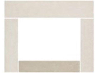
Optional Riser Panel

Request by phone or during measurement confirmation process for an additional charge