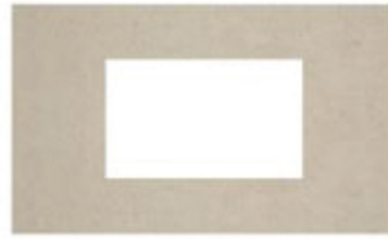
Picture Frame Seamless Facing Request by phone or during measurement confirmation process for an additional charge