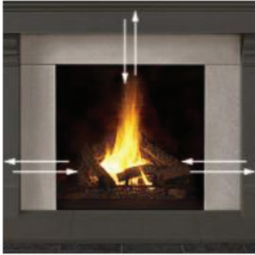
Standard Adjustable Facing

Adjustable Facing comes in 3 pieces that adjust to the width and height of your firebox (*the 3 piece kit may have to be cut on site).