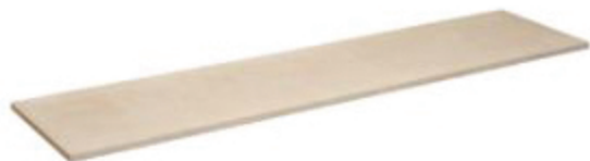
Flat Hearth (1 Piece): 1" Tall

NOTE If you require a special shape let us know (ie: U-shape hearth)