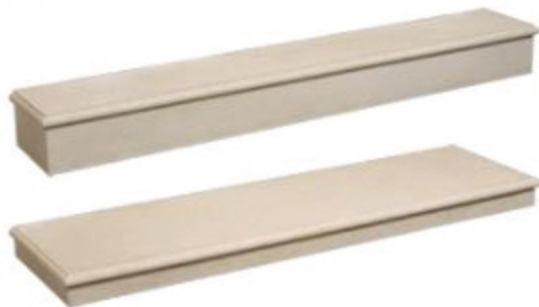
Raised Hearth (1 Piece): 2"-18" Tall